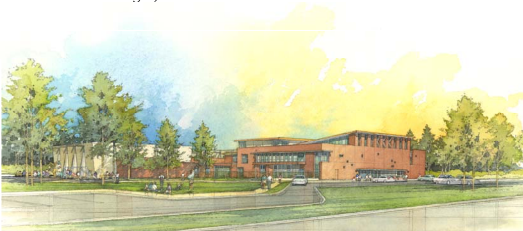
West and North Elevation- View from Capitol Expressway Entrance